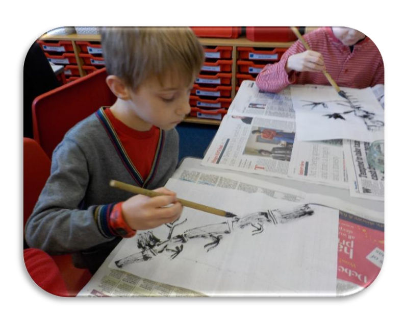
Learning TaiJi / Tai Chi