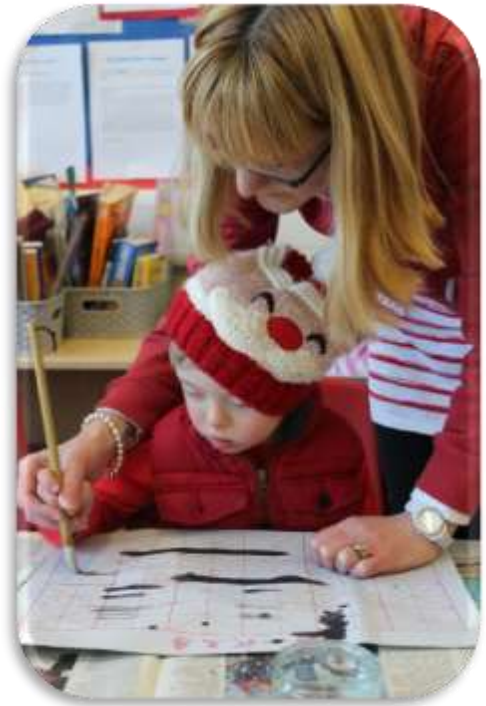
Learning TaiJi / Tai Chi